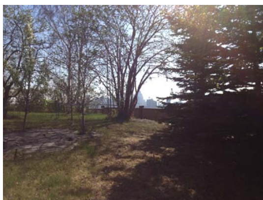
Rear yard looking east